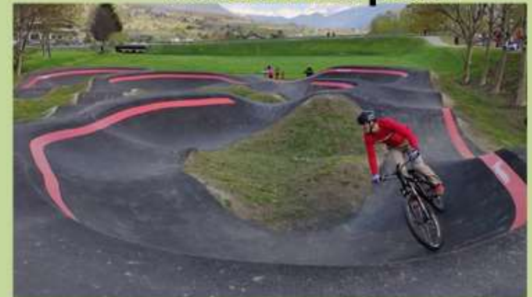
that's the pump track