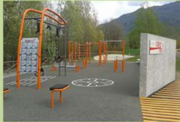
This is the fitness park

In Valtellina, there are cyclable paths that cross the valley and our country. From here, you can admire the wonderful landscape of the valley. There are also many eco-sustainable activities with bicycles or sport activities