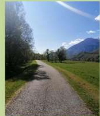
that's the Valtellina path