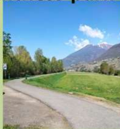
this is the Valtellina path