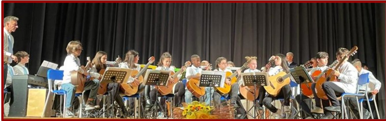
students during an exhibition

Our school organizes afternoon courses where students have the possibility to learn how to play an instrument such as the Piano, the Violin, the Flute and the Guitar.