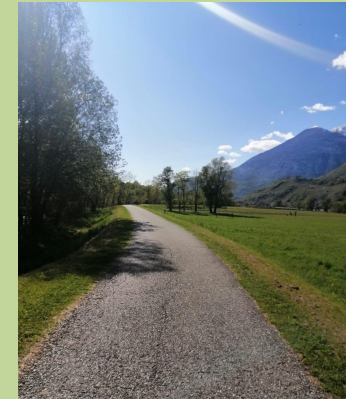
THAT'S THE VALTELLINA PATH