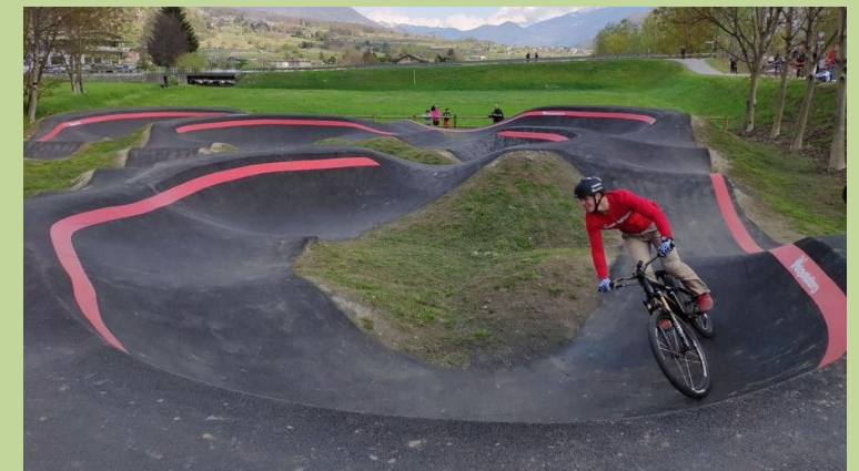
THAT'S THE PUMP TRACK