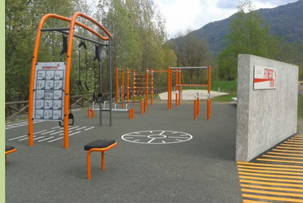
THIS IS THE FITNESS PARK

IN VALTELLINA, THERE ARE CYCLABLE PATHS THAT CROSS THE VALLEY AND OUR COUNTRY. FROM HERE, YOU CAN ADMIRE THE WONDERFUL LANDSCAPE OF THE VALLEY. THERE ARE ALSO MANY ECO-SUSTAINABLE ACTIVITIES WITH BICYCLES OR SPORT ACTIVITIES.