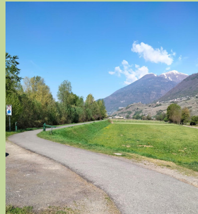
THIS IS THE VALTELLINA PATH